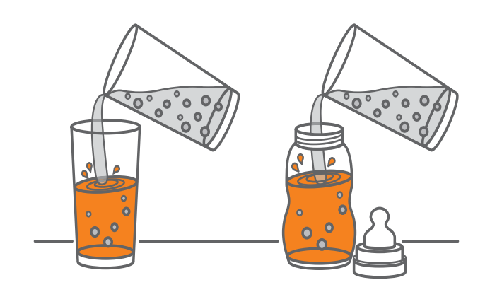
To facilitate the administration - especially for babies an children - dissolve the required amount in a drink, e.g. juice or tea.

Iodine tablets are a medicinal product. Please read the package insert carefully.